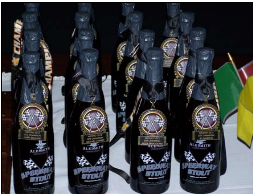
Neohio Region Championship Awards