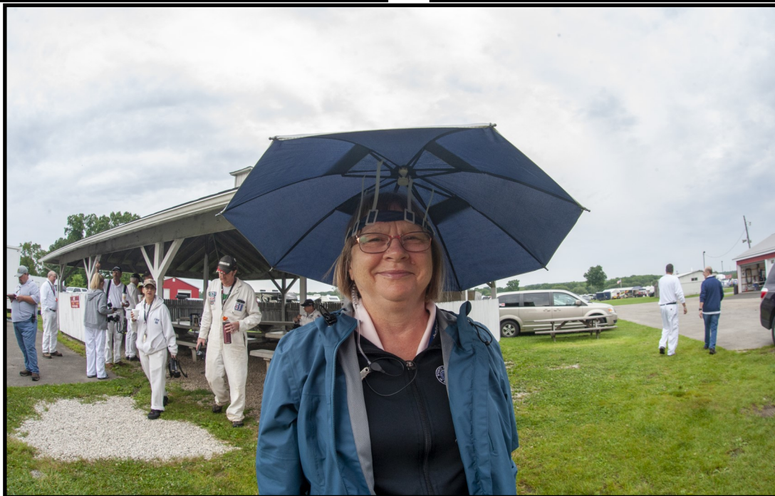
These photos and those on the following page.