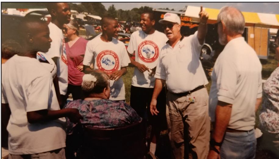
Inner City Kids Tour Nelson