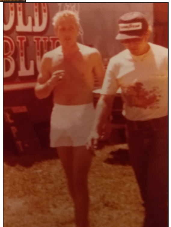
Paul Newman 6/76