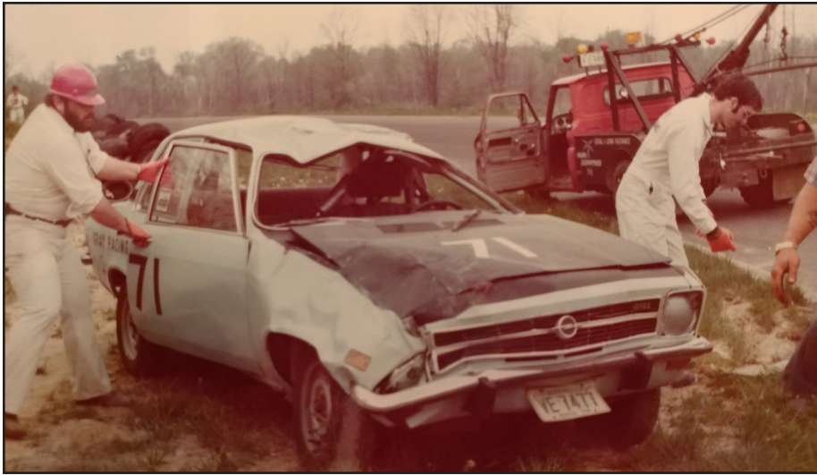
Ed Mandel's Wreck at Driver's School 5/75