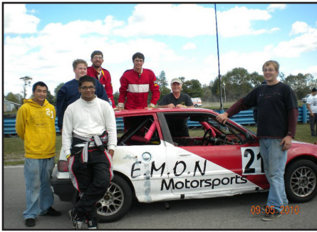
Evil Minions of Nelson 2010 People's Choice Award