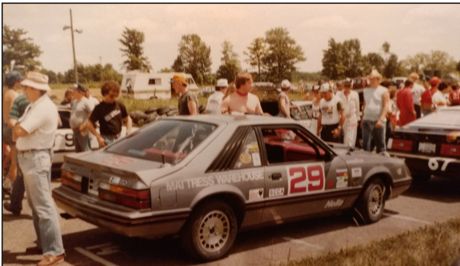
On the Grid 1983 Mustang 83 LD