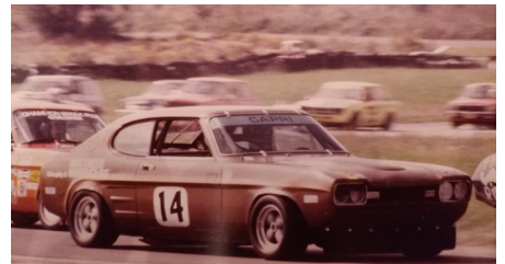
Bill Stables Capri Enduro 9/80