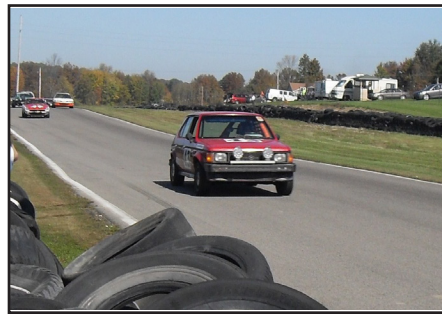
Finishing 25 hours + 2011 ChumpCar