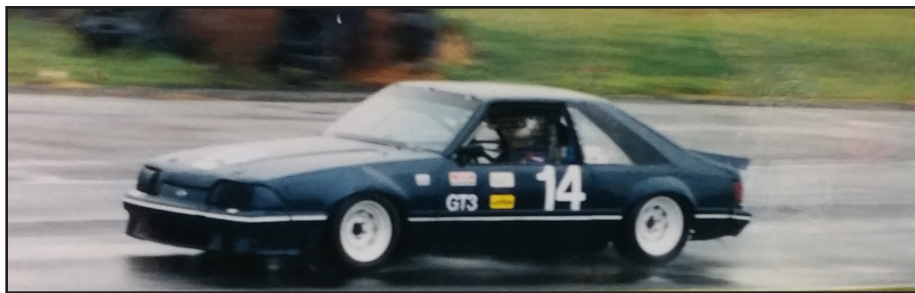
Kryderacing Champion Mustang 1985