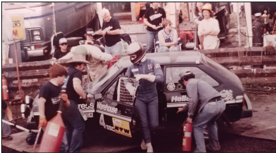
Love Potion Number 4 Fiesta 81 LD