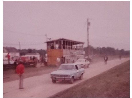
First Race at Nelson 5/73