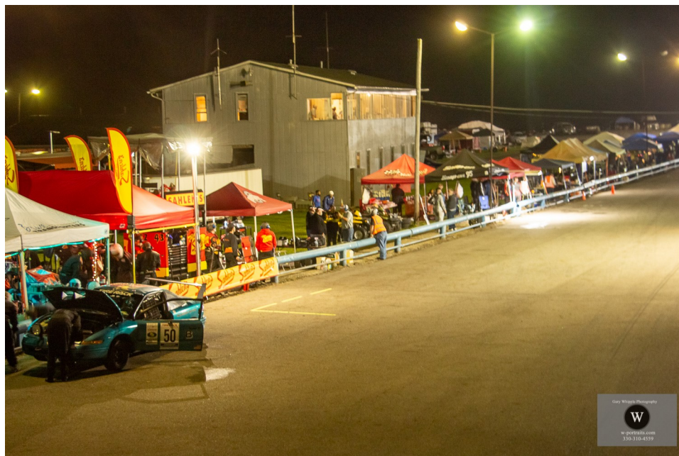
Night shot of a running of the longest Day at Nelson Ledges

Follow us on FB and IG @WingmanGarage – Check out our Google Reviews!