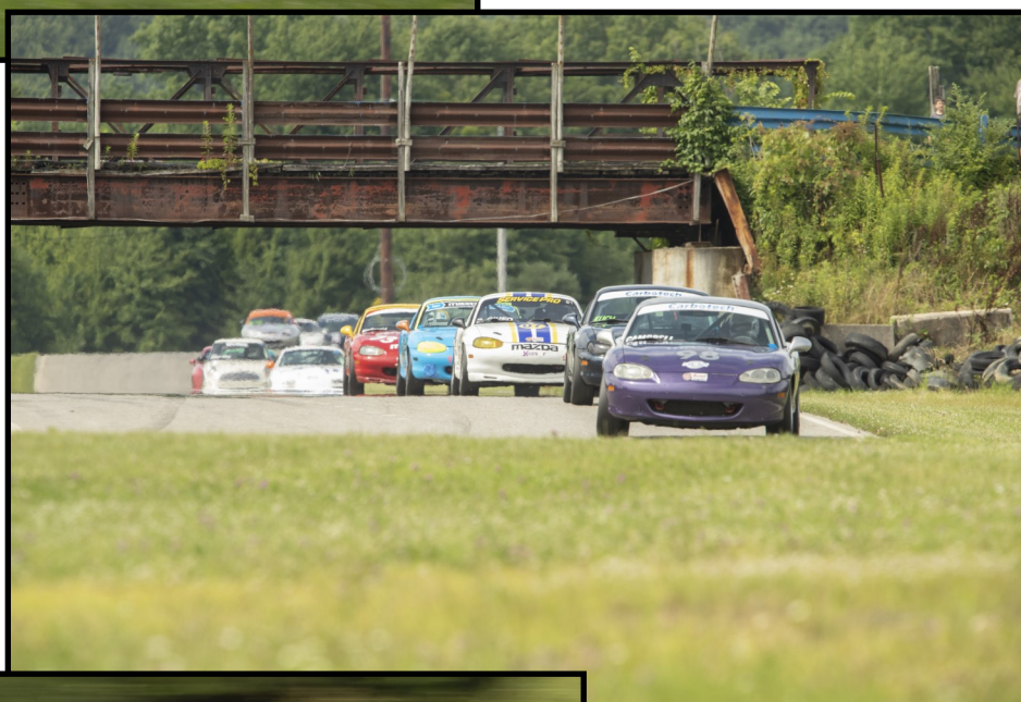
A pack of SM's under the bridge.