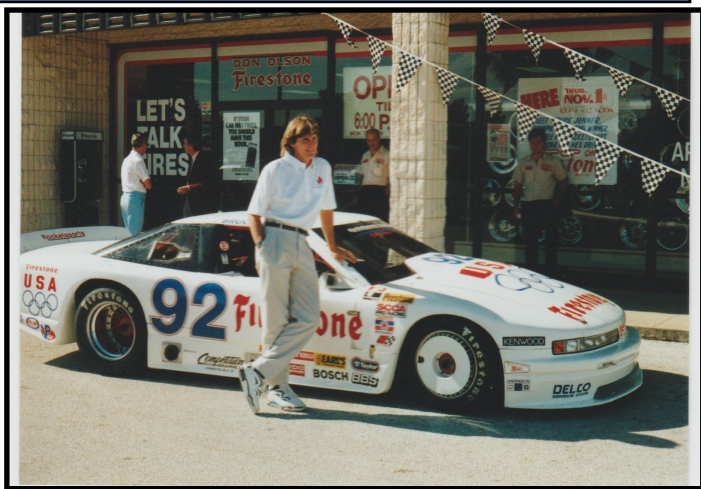
At left is the grid for the Firehawk race at Road Atlanta. At right is a photo of Olympic gold medalist a Bruce Jenner who was a Firestone spokesperson and raced in the IMSA GTO class in a Roush Racing Ford Mustang, winning races with team-mate Scott Pruett.