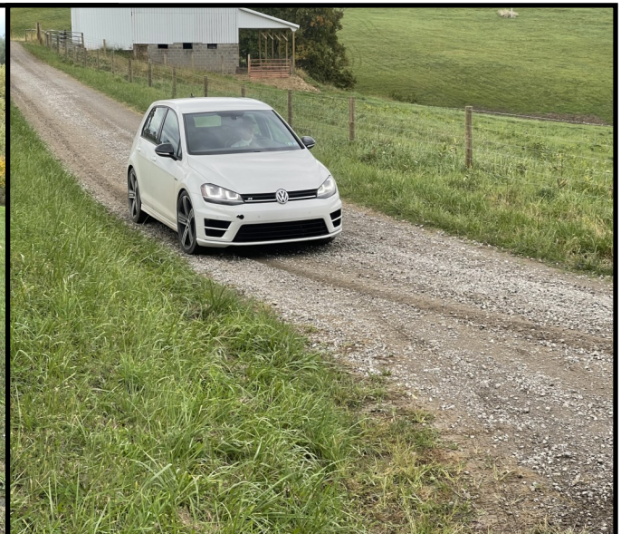
Some Photos From the Johnny Appleseed Rally!