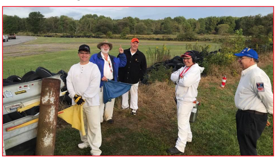
Volunteers working hard at Nelson Ledges.

To close this month out we do have our Annual Membership Meeting coming up in November. It would be great to get some new people on the Board to get involved with the operations of our club. We have come a long way in 2019 and plans are for a bigger 2020. Please attend our October meeting to see if this is something you want to be a part of.