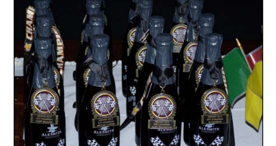
Neohio Region Championship Awards