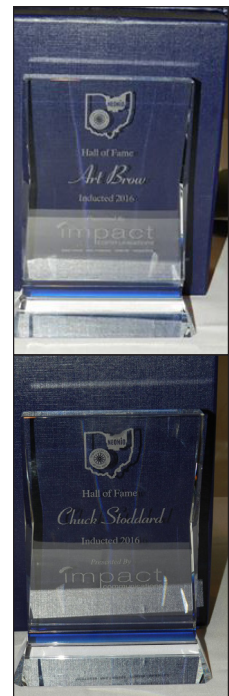
Art Brow & Chuck Stoddard Hall of Fame