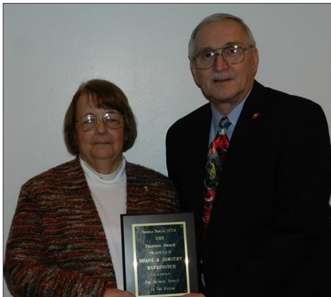
Dorothy and Duane Harrington Trustee's Award