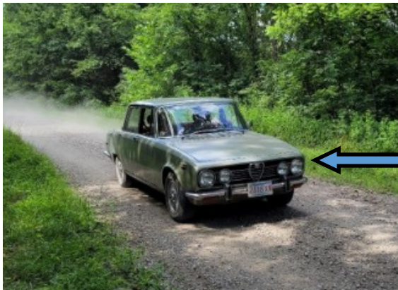
Photos from the Milk Run Rally. One entrant drove a 1971 Alfa Romeo all the way from Massachusetts to take part in the Rally!

Johnny Appleseed Rally, October 1, 2022: Neohio will host the Johnny Appleseed Rally on Saturday, October 1, 2022. Starting in Bolivar, the ~160 mile course will wind through the hills of Ohio's Tuscarawas, Harrison, and surrounding counties. Look for more information and registration specifics here: msreg.com/JAR22