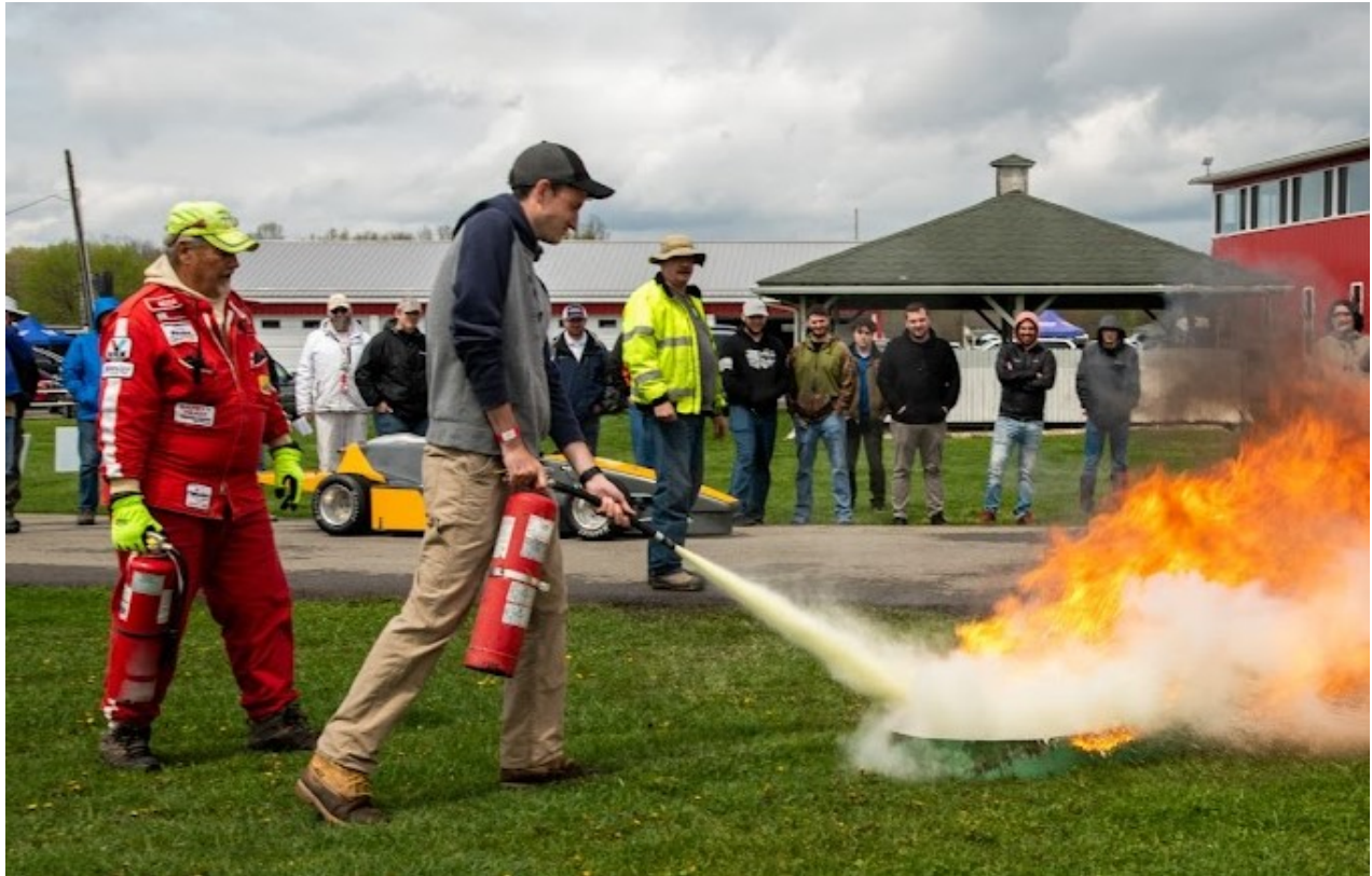
Photographs courtesy of Car.nation_01 Automotive Photography. Thank you! Above: Extinguishing a fuel fire during the Day of Motorsports event.