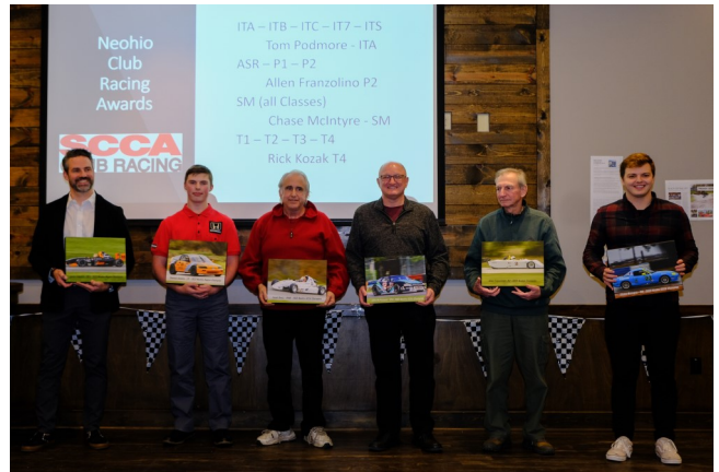
Several drivers accept their trophies for various Neohio Road Race championships by class