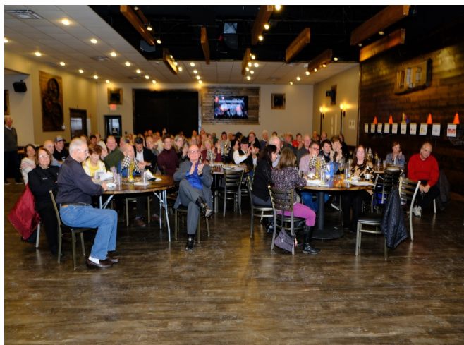
Nearly 100 members and guests attended the Awards Celebration.