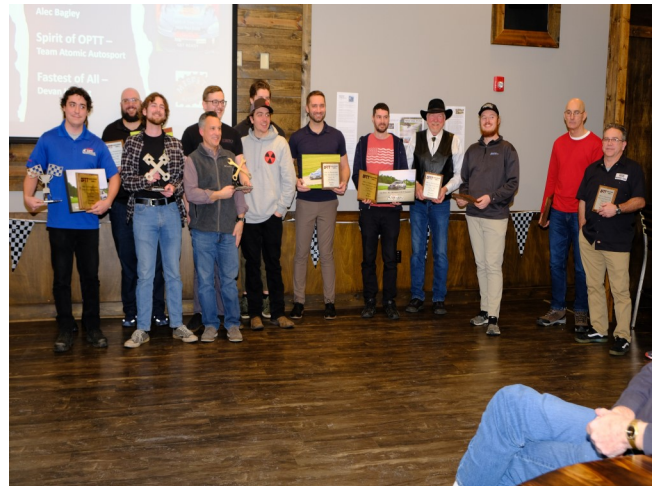
A number of drivers receiving the OPTT Championship Award for the Class.