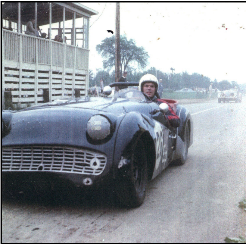
An historic photo of a Triumph TR3 heading down the pit lane. The old timing tower to the left.