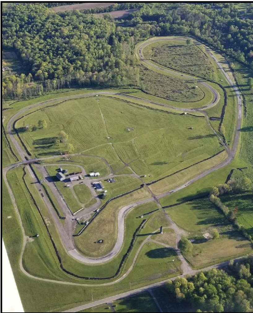
Our “home” track after some of the trees adjacent to Stations 4 through 10 were removed.