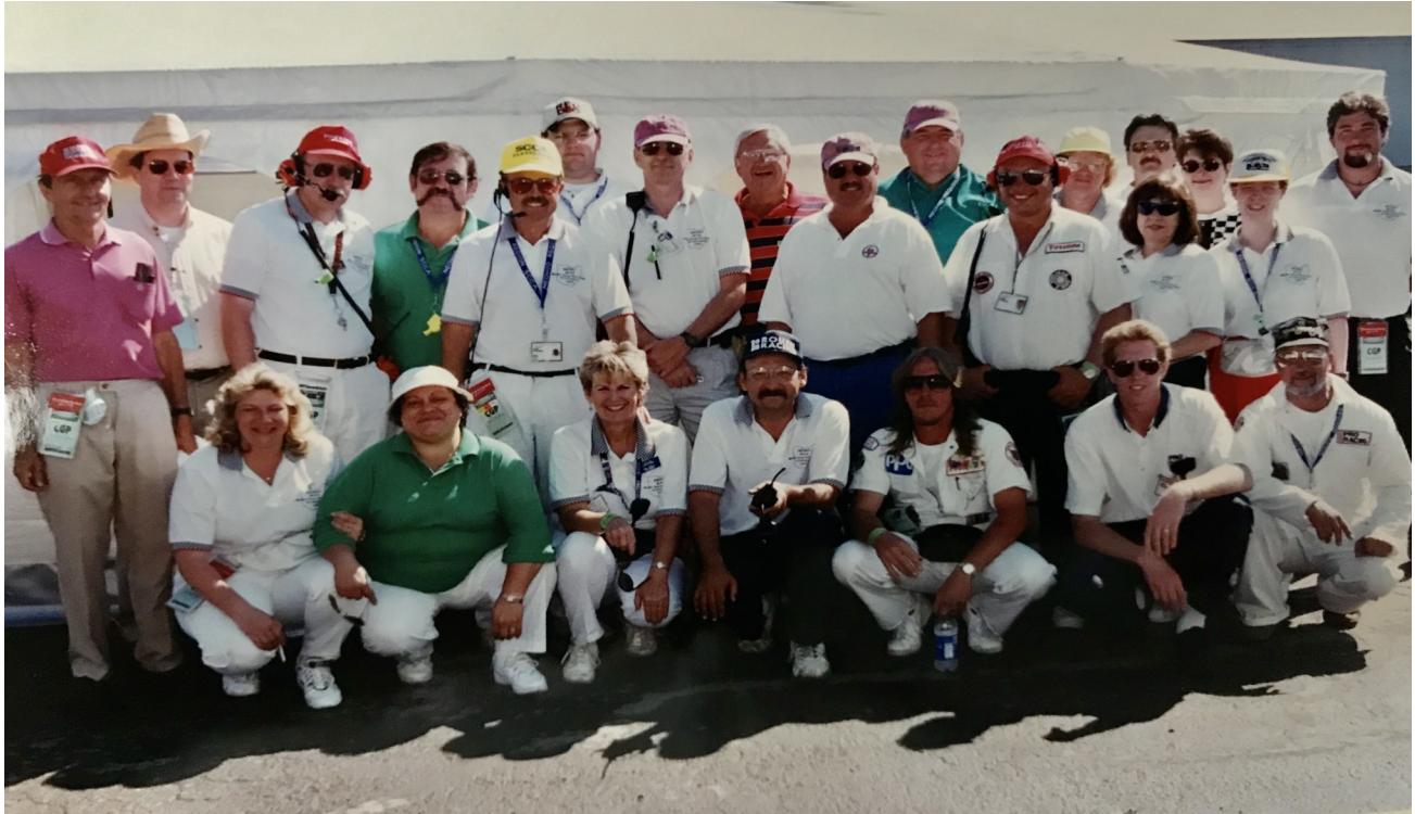
A photo of some of the volunteers at one of the Cleveland Grand Prix races.