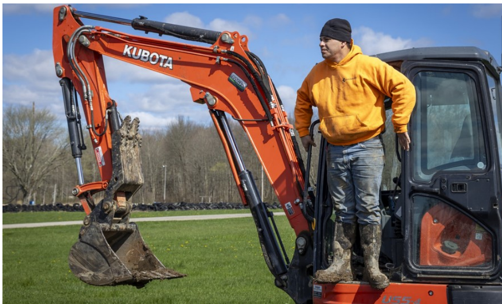
NELSON LEDGES CLEANUP DAY PHOTOS—APRIL 13TH

Neohio Region would like to extend our thanks to Summit Racing Equipment for their longstanding support of Neohio Region and motorsports activities in our area! Please show your support by being a customer of our home-grown speed shop.