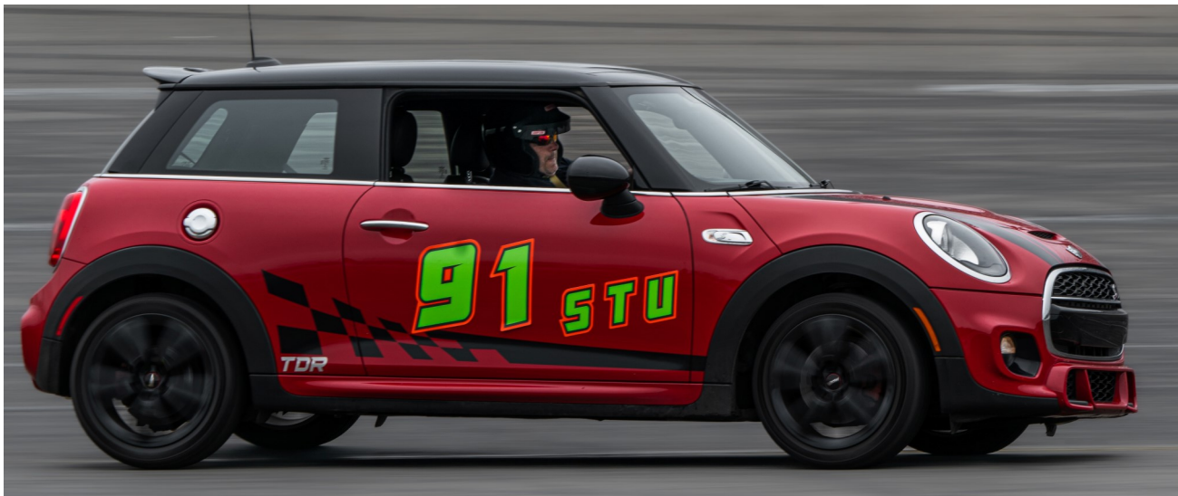
More photos from Neohio's recent solo events.